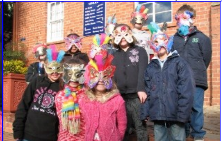
Grade 1s made Festival masks!