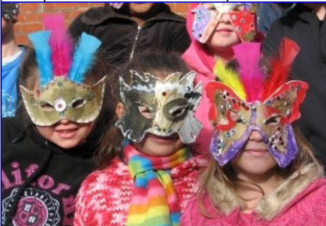
Beautiful butterfly girls.