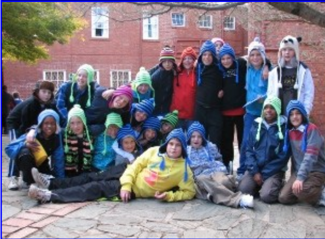
Funky hats are the flavour of this year's Festival!