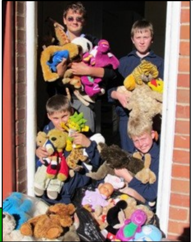
Some of the many toys and blankets collected by the generous Prep community.