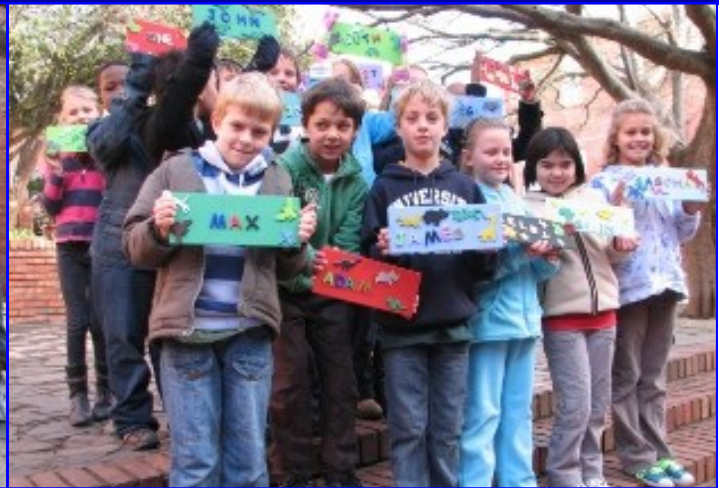
Grade 3s with their hand-made name plates.