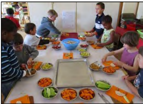
Baking Day Mondays!

Grade R parents - please remember to notify Tanya about whether your children will be moving onto Grade 1 in 2012.