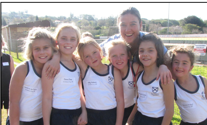
U9 girls at the Independent Schools' Cross Country Event

The second round of the East Cape Shotokan-Ryu karate league in 2010 took place in Grahamstown on Saturday the 26th of July 2010. The event was well attended (80 competitors) and the following St Andrew's karate-ka achieved medals: