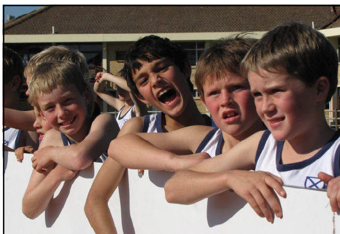
Hey, this is fun! These U9 boys wait in anticipation for their race at the Independent Schools' Cross Country event.

18:30 Evening Prayers - Duty Master (Memory Hall)