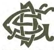
THE DIOCESAN SCHOOL FOR GIRLS